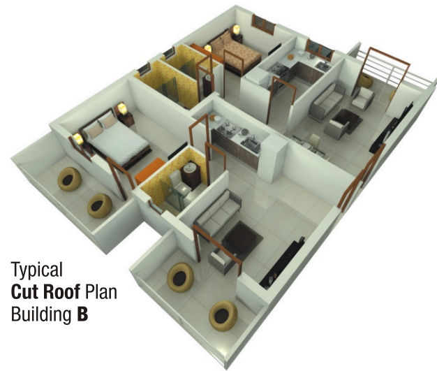
Typical Cut Roof Plan Building B